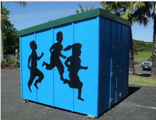
Springbank students built a Play House for earthquake damaged Mt Pleasant School in Christchurch and received the top Student-Initiated Enterprise Award.