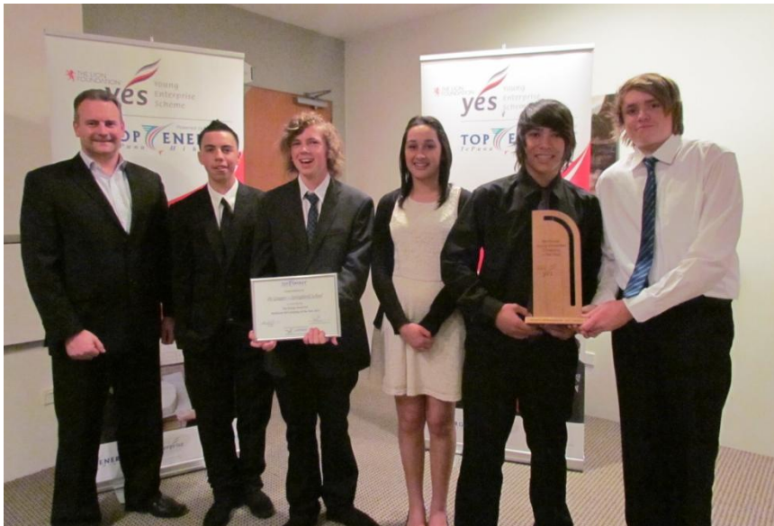
Dr Gripper: Northland Young Enterprise Company of the Year

The team will travel to Wellington for the YES National Awards in December and we wish them all the best.