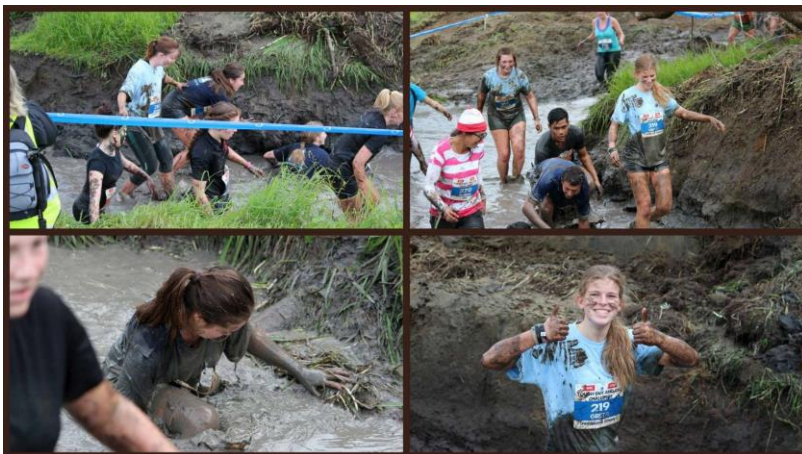
Springbank students competing in the Tough Guy and Gal Challenge