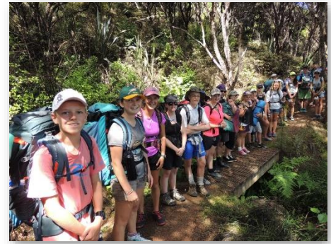
A welcome breather in the cool of the bush.