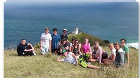
Our Internationals at Cape Reinga