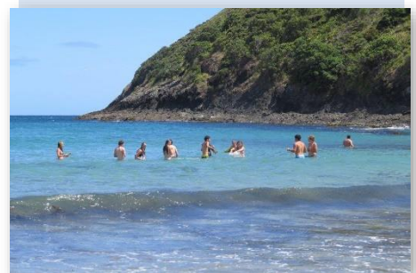
Spirits Bay. It doesn't get better than this!!!