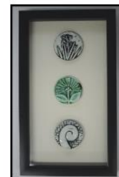
360mm x 210mm Ceramic Art Large Price: $60