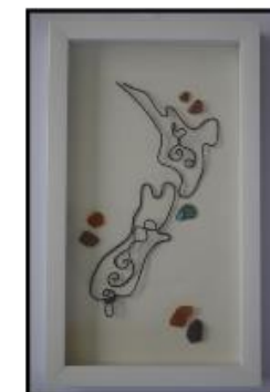
360mm x 210mm Wired Aoteroa Price: $60