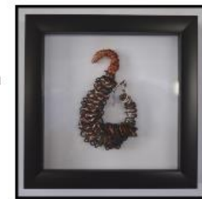
190mm x 190mm Maui's Hook Price: $120