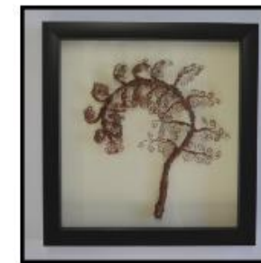
260mm x 250mm Wired Koru Price: $100