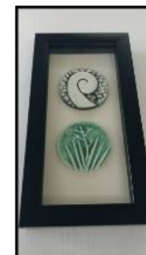
250mm x 130mm Ceramic Art Small Price: $40