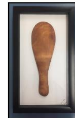
360mm x 210mm Kauri Patu Price: $80