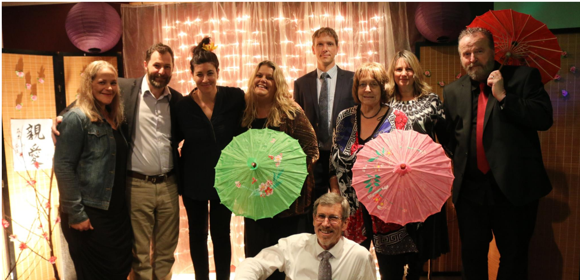
Newsletter No.6 | July 2017