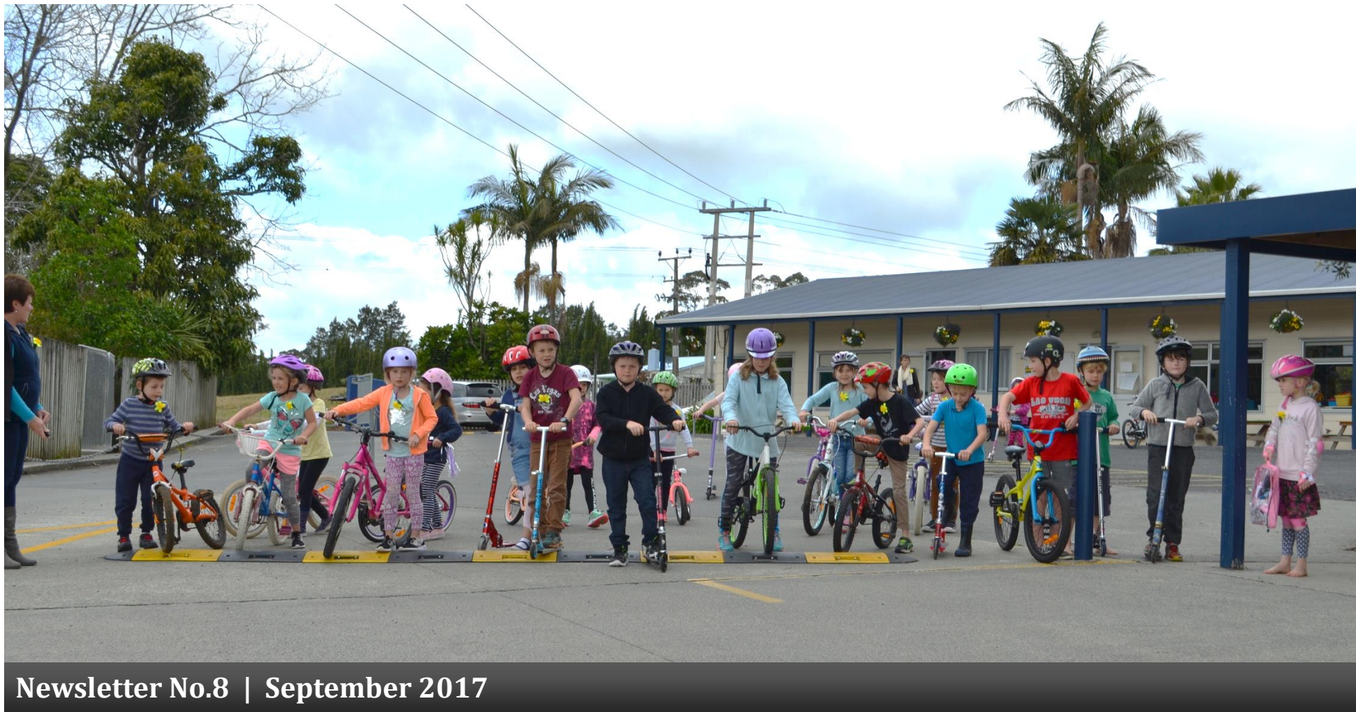
Newsletter No.8 | September 2017